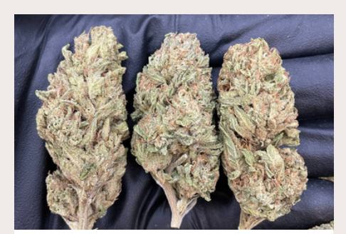
GIRL SCOUT COOKIES