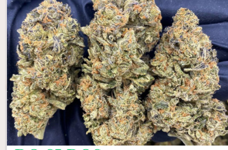
DO SI DOS